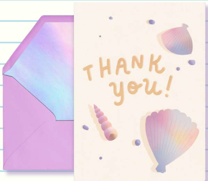
SANDY SEASHELL THANK YOU CARD