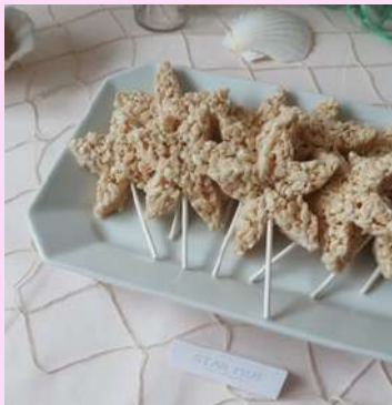
RICE KRISPIES STARFISH