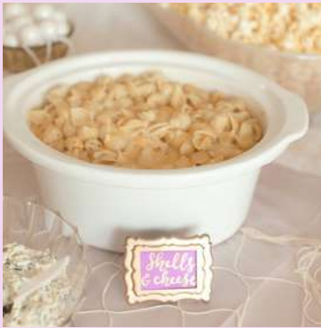
SHELLS & CHEESE