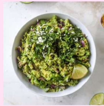
NOW THAT WE DON'T "GUAC"