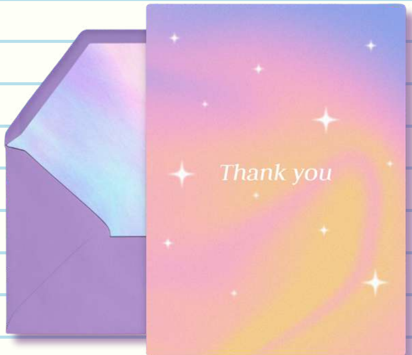
DREAMY HOLOGRAPHIC PARTY PINK THANK YOU