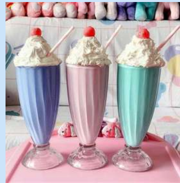
MILK-SHAKE IT OFF