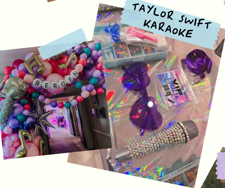
TAYLOR SWIFT KARAOKE