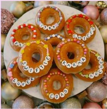
FRIENDSHIP BRACELET DONUTS