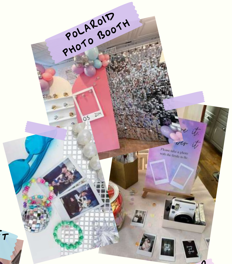
POLAROID PHOTO BOOTH